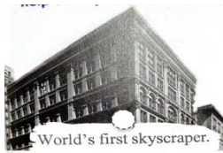
Home Insurance Building