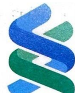
Standard Chartered Bank